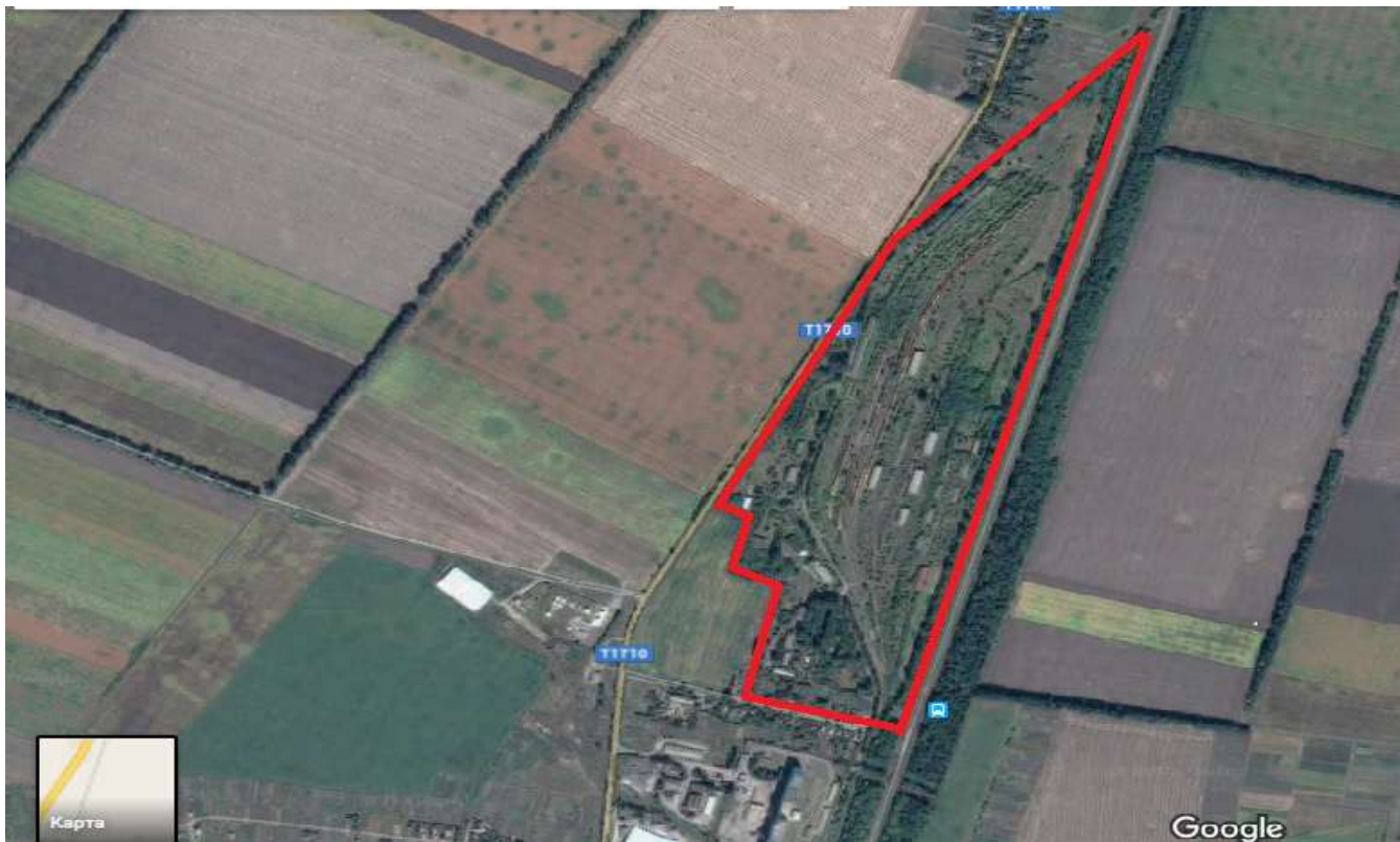
Photo: the territory of the former Baza 32