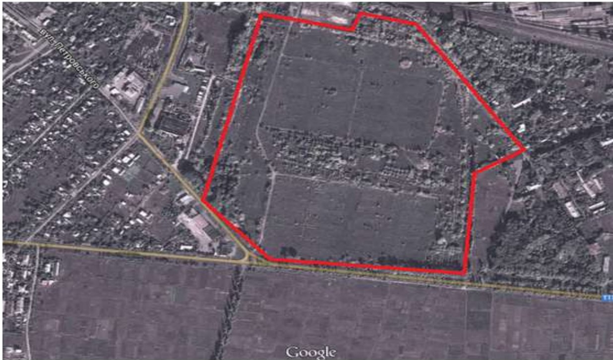
Photo: the territory of the former Kombinat Donetskyi

The Town Council' territories include two more land lots that we offer for industrial enterprises construction.